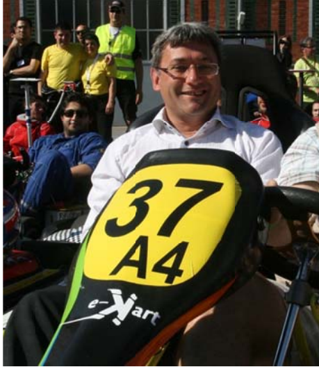
The nassau panel

The kart will wear his number legibly on the front panel nostril on the two sides and rear. The kart number is the number of the team, 37H, for example, if there is only one kart. It is followed by a number if there are several karts in the team: 37H1 and 37H2.