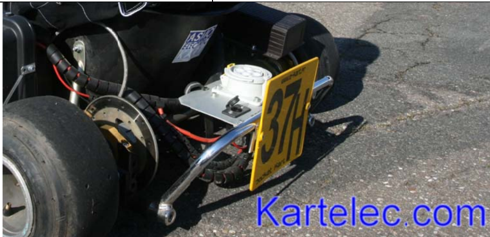
On the rear panel of the kart